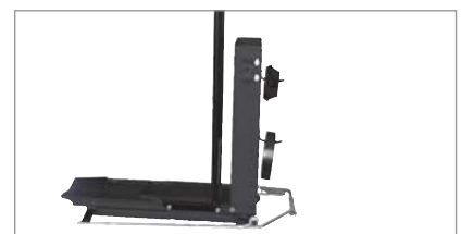
Pneumatic loading device