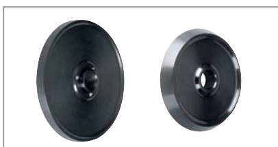
Standard clamping kit with 2 truck cones (198 – 225 mm / 270 – 286.5 mm)