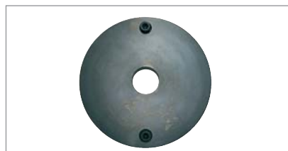
Pre-centring ring for light-truck wheels

For truck / light-truck wheels with pitch circle diameters of 170 / 184,15 / 205 / 222,25 / 245 mm