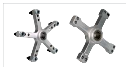
Professional clamping kit for stud-hole location of wheels with 4-arm / 5-arm star and 5 bolts